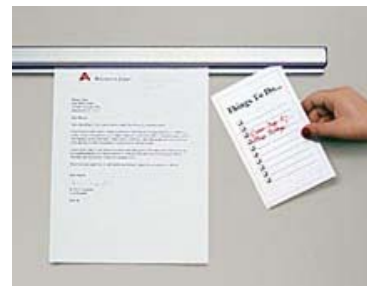
Map Rails many types

This tackable, durable, washable floor-to-ceiling and wall-to-wall communication surface is the perfect alternative to boring bulletin boards or dark cork wall tiles that crumble, deteriorate, and destroy wall surfaces. Tac-A-Cork is a colorful linoleum/cork wallcovering that quickly, easily, and economically turns walls, doors, partitions, panels, and room dividers into decorative and functional spaces. It comes in 12 non-reflective decorator colors and it is as practical as it is beautiful. Self-healing its exceptionally resilient. It resists cracking, drying, or peeling, and the washable surface continues to look new even after years of use. Composed almost exclusively of natural, environmentally-sensitive raw materials, Tac-A-Cork is bio-degradable, hygienic, and inhibits the growth of bacteria. Comes in flexible rolls; calendared to a smooth finish onto jute (burlap) backing for excellent adhesion and dimensional stability.