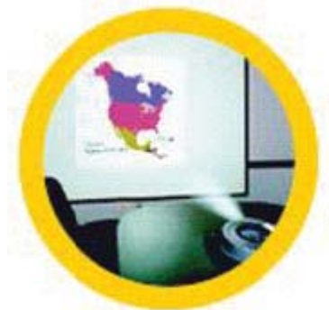
Project and Dry Erase