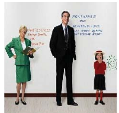
Floor To Ceiling