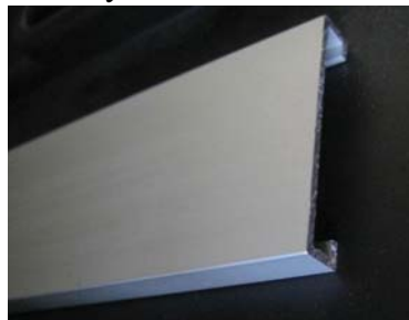
Finish Trim IND-6 H-Bar