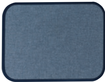
SHOWN WITH OPTIONAL POWDER COAT FINISH