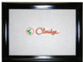
SHOWN WITH OPTIONAL EMBROIDERY LOGO

Specify tack surface material after model #: D for Designer Fabric; F for Fabriccork; or CC for Claridge Cork. *Add 1.5 lbs. per sq. ft. for weight of Claridge Cork tackboards.