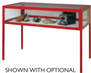
SHOWN WITH OPTIONAL POWDER COAT FINISH