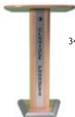
348 LECTERN WITH OPTIONAL LASER CUT NAME/LOGO