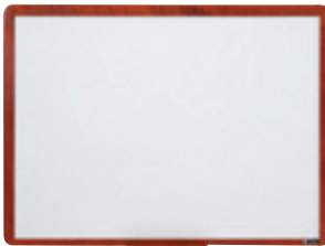
AVAILABLE IN BOTH MARKERBOARD AND CHALKBOARD