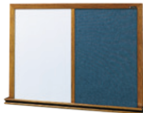
AVAILABLE IN BOTH MARKERBOARD AND CHALKBOARD