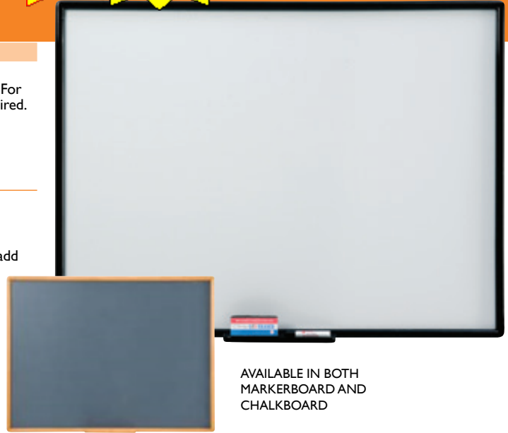
AVAILABLE IN BOTH MARKERBOARD AND CHALKBOARD