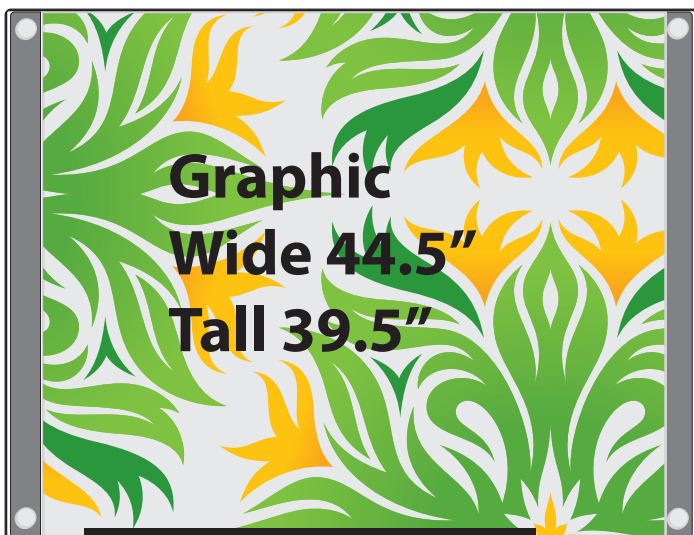
Top Load Landscape