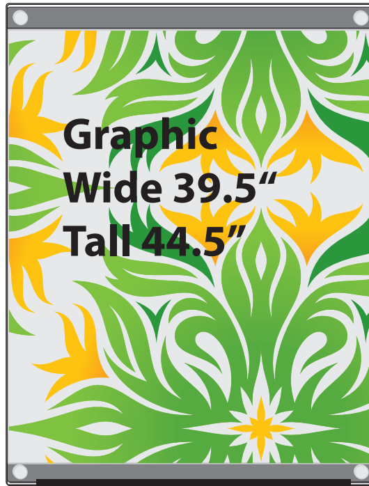
Side Load Portrait